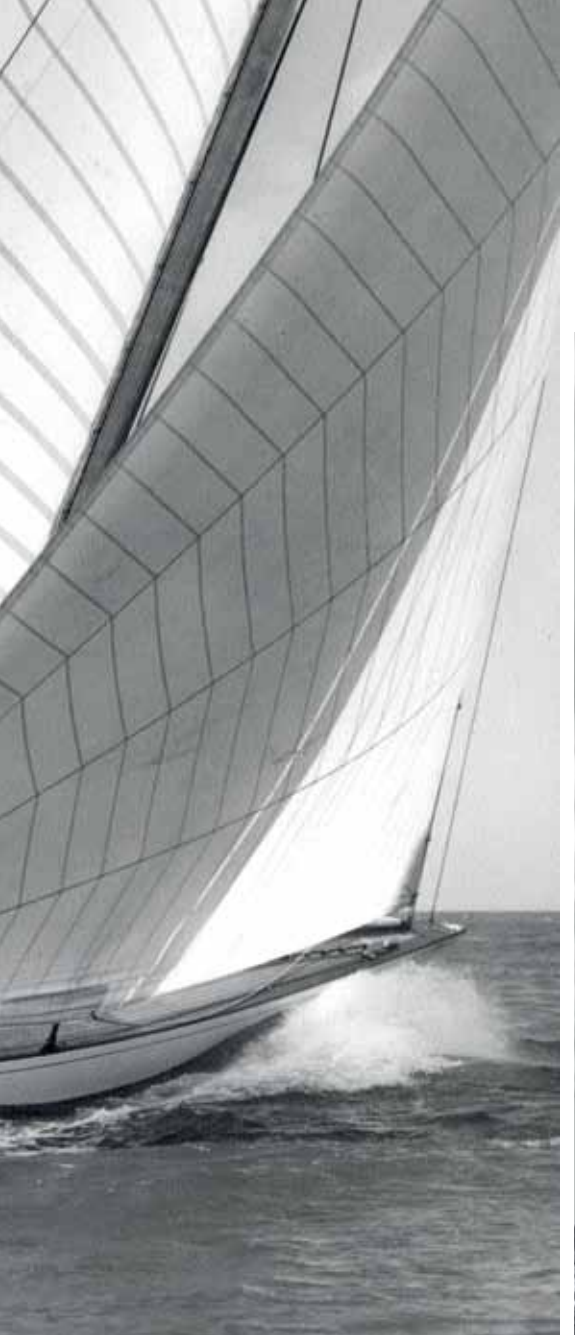
Left: Sceptre off Cowes. Below: In trials with Evaine off Cowes, 1958